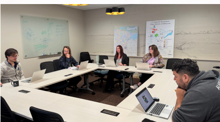
Weekly data analyst team meeting

Each analyst brings their unique perspectives and skills, which is why we value open dialogue and discussion as we analyze the data. We also contribute to research deliverables, such as presentations to the community, conferences, reports, and papers. We enjoy being able to engage and collaborate with others throughout MK-MDT and partnering communities in the work we do.